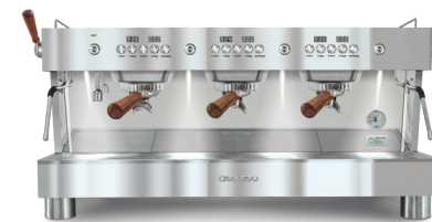
3GR Full Inox