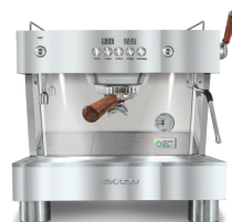
1GR Full Inox