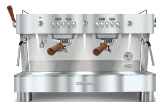
2GR Full Inox