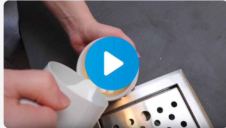
Espressospezialisten-Review (3 min)